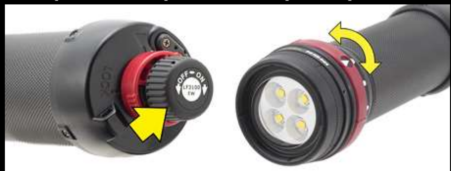
Left: \[ \subseteq \text{Switch \]_controls ON/OFF of the unit and two power settings. Right: The \[ \subseteq \text{Selector Ring LF \]_(red ring) offers 6 steps power setting.

The 「switch」 and 「Selector Ring LF」 is mechanical switch to support user friendly controllability with less torque for intuitive operation to control power output.