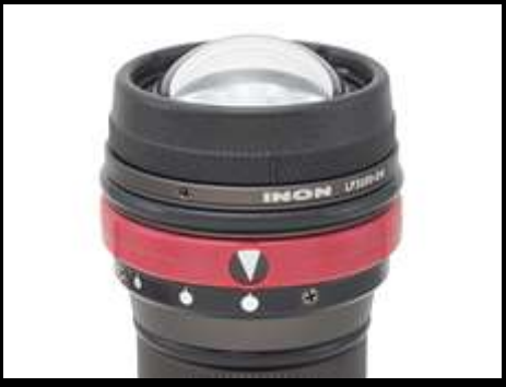
Dome lens of the 「LF3100-EW」