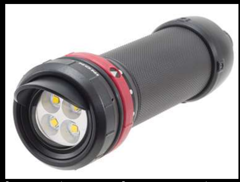
「LF3100-EW」(with packaged 「Light Shade LF-EW」)

--Retail in Japan: JPY36,800 --JAN code: 456212143 844 6