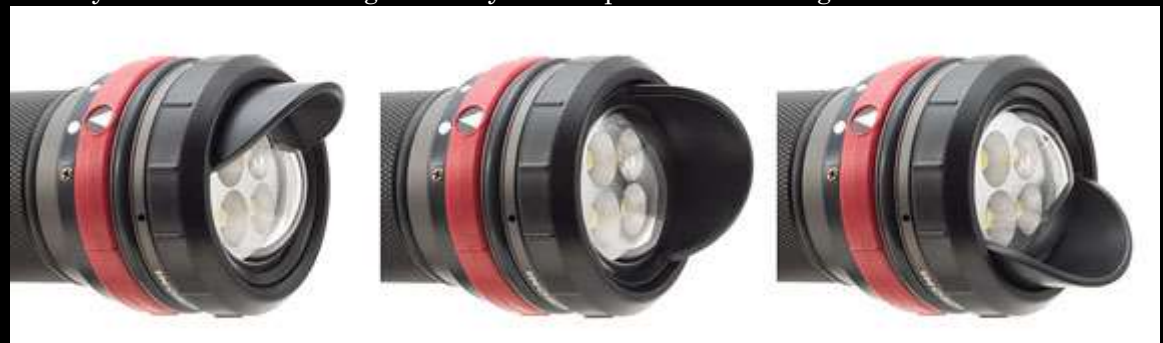
With 「Light Shade LF-EW」 installed.

Packaged 「Light Shade LF-EW」 which rotates 360 degree o prevent LED light from illuminating vicinity of camera lens to significantly reduce problem of flare/ghost.